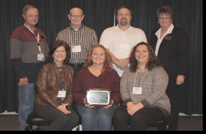
Monona County Fair, Onawa – SW District