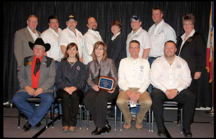
Delaware County Fair, Manchester – NE District