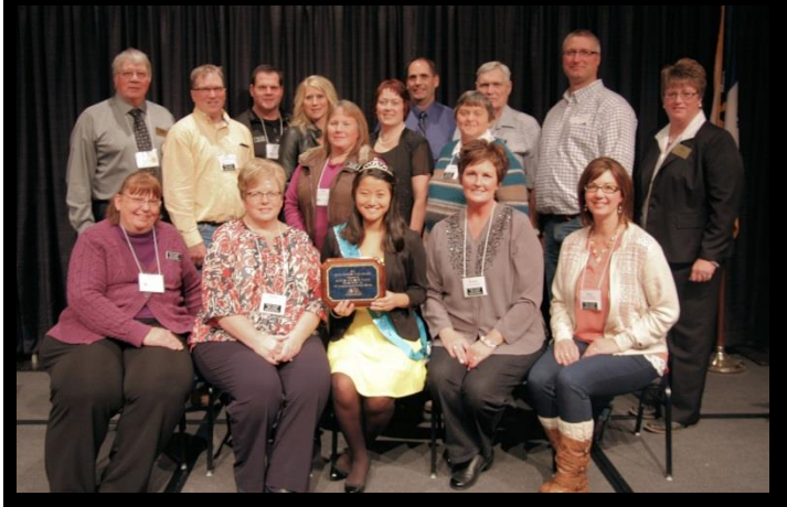
Sioux County Youth Fair, Sioux Center - NW District