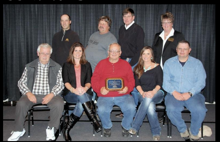
Grundy County Fair, Grundy Center - NC District