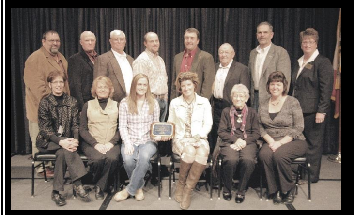
Appanoose County Fair, Centerville – SC District